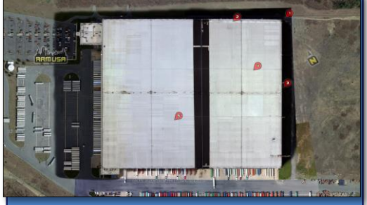
High resolution base photo